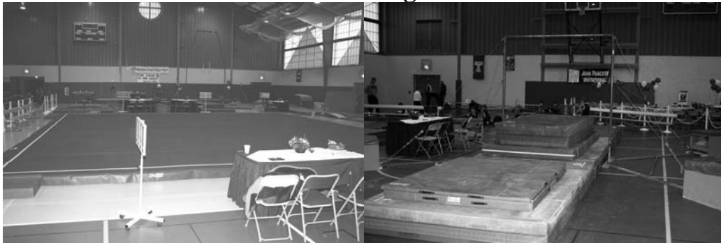
Spacious competition area and excellent viewing conditions